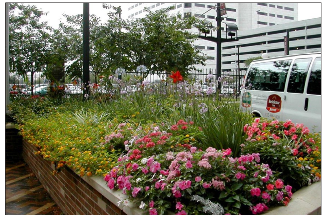
Rooftop Garden on the Marriott Hotel Parking Garage (Humble Oil Building, Houston, Texas)